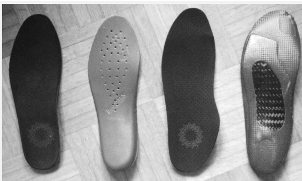
Figure 1. Placebo and cycling shoe insoles, back and front (left: placebo insole, right: carbon insole).

Between the various WAnTs, the athlete paused 10 minutes (active rest) plus 2 minutes for adaptation after the insole switch, which took 2 minutes as well. The resistance during the adaptation phase was 100 W. The relevant parameter was mean power and peak power during the WAnT. The test design is shown in Figure 2.