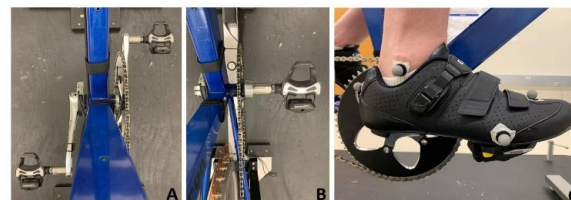
Figure 1. Ergometer setup. Figure 1A: Largest Q-factor (210 mm) configuration; Figure 1B: Pedal with the 30 mm spacer, and; Figure 1C: Marker placement on the foot.

Participants completed each condition by pedaling at their preferred power output and cadence (determined in the familiarization session) for five minutes. During this 5-minute cycling, after the second minute the participants were asked to rate their comfort of cycling using an enlarged 0 to 10 mm Visual Analog Scale, where a larger number indicated greater discomfort (Gardner et al. 2015; Thorsen et al. 2019). Marker position data during the experimental conditions were captured during the last two minutes of the five minutes of each condition. A 3-5-minute rest interval separated the conditions during which the pedals were prepared for the subsequent condition. After each fitting, the pedals were tightened to a torque of 45 Nm with a calibrated torque wrench based on the manufacturer guidelines.